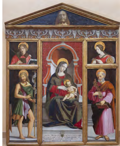
Cola dell'Amatrice, known as Filotesio , Virgin Mary and child enthroned between Saints John the Baptist, Stephen, Peter, Lucy and the Redeemer

The second section is devoted to Renaissance painting: alongside works by Carlo Crivelli, Antonio Vivarini, Pietro Alamanno and Cola dell'Amatrice, one of the masterpieces by Lorenzo d'Alessandro is featured. The painting depicting the Virgin Mary and child enthroned between Saints Anne, Roch and Sebastian (second half of the 15th century) is housed in the Museo Piersanti in Matelica, but originally came from the now-demolished Church of San Michele Arcangelo.