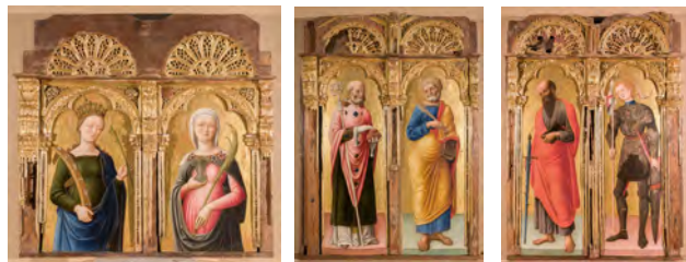
Antonio Vivarini , Saints Lucy and Catherine of Alexandria; Saints Peter the Apostle and Nicholas of Bari; Saints Paul and George