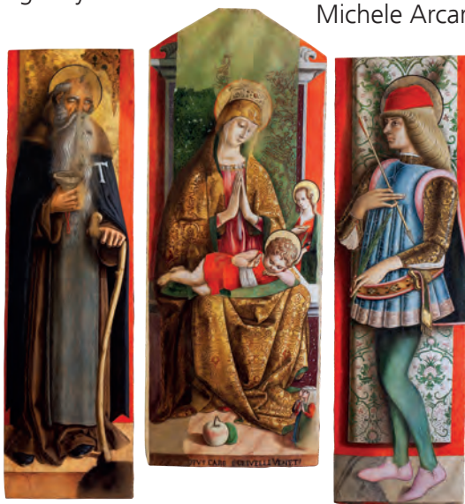
Carlo Crivelli , Second Triptych of Valle Castellana, Virgin Mary and child enthroned between Saints Sebastian and Anthony Abbot

The first section, dedicated to medieval works, features grand wooden crucifixes, including a remarkable example with relief on a shaped cross and a starry blue sky, created for the early Christian church of the Most Holy Saviour in Ancona (now Santi Pellegrino e Teresa, following 18th-century renovations). This 13th-century crucifix belongs to the Christ Triumphant ( Christus Triumphans ) type, similar to the one from Matelica, which is also on display.